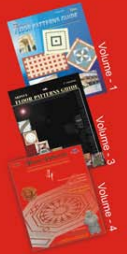
FLOOR PATTERNS GUIDES

Flooring & Decor Guide of Marbles Granites Stones Ceramic (Vitrified)