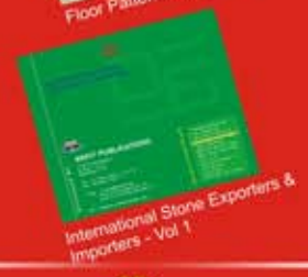
International Stone Exporters & Importers - Vol 1