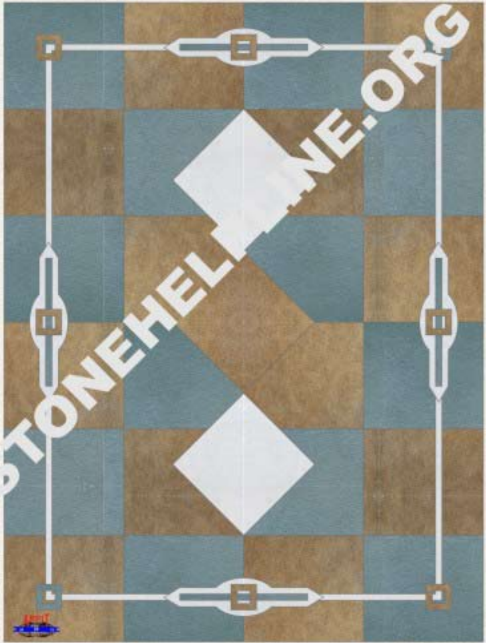
Scale : 1 Feet = 30.52 mm

The above pattern may also be designed as per your chosen or available marble, granite or stones. Please feel free to contact us. हमारे पास कर्मी की डीजाइन का बहुत ज्ञान करने महादेव मार्बल, इलाइट क्वार्टा स्टोन का भी काम करते हैं। सहायोग हेतु सम्पर्क करें।