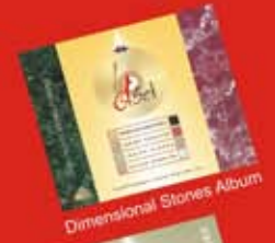
Dimensional Stones Album

Inside : Floor Planner Border, Skirting & L-planner Handicraft Show Case Display Elevation Planner Mouldings / Profiles Stone Gallery