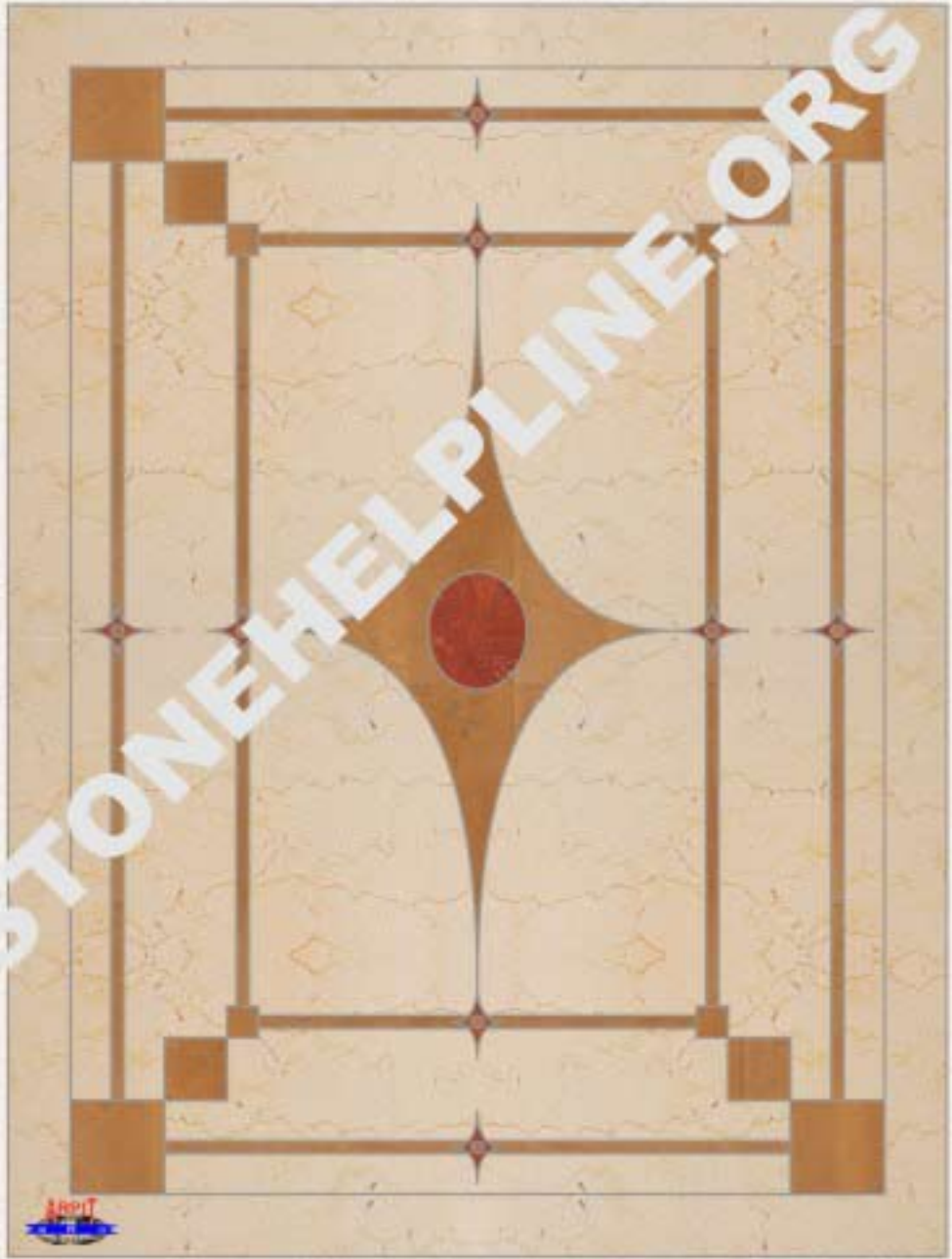
Scale : 1 Feet = 30.52 mm

The above pattern may also be designed as per your chosen or available marble, granite or stones. Please feel free to contact us. उपरोक्त पट्टी की डिजाइन का रूप कागज करने में सक्षम मार्बल, ग्रेनाइट तथा स्टोन का भी बनाया जा सके है। सहायोग हेतु सम्पर्क करें।