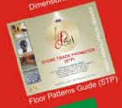
Floor Patterns Guide (STP)