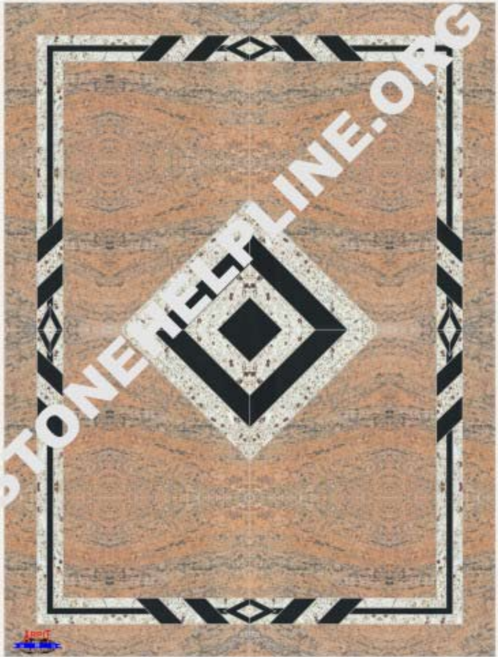
Scale : 1 Feet = 30.52 mm

The above pattern may also be designed as per your chosen or available marble, granite or stones. Please feel free to contact us. उपरोक्त पैटर्न को आपका चुने हुए या उपलब्ध मार्बल, ग्रेनाइट या स्टोन का भी बनाया जा सके है। सहायोग हेतु संपर्क करें।